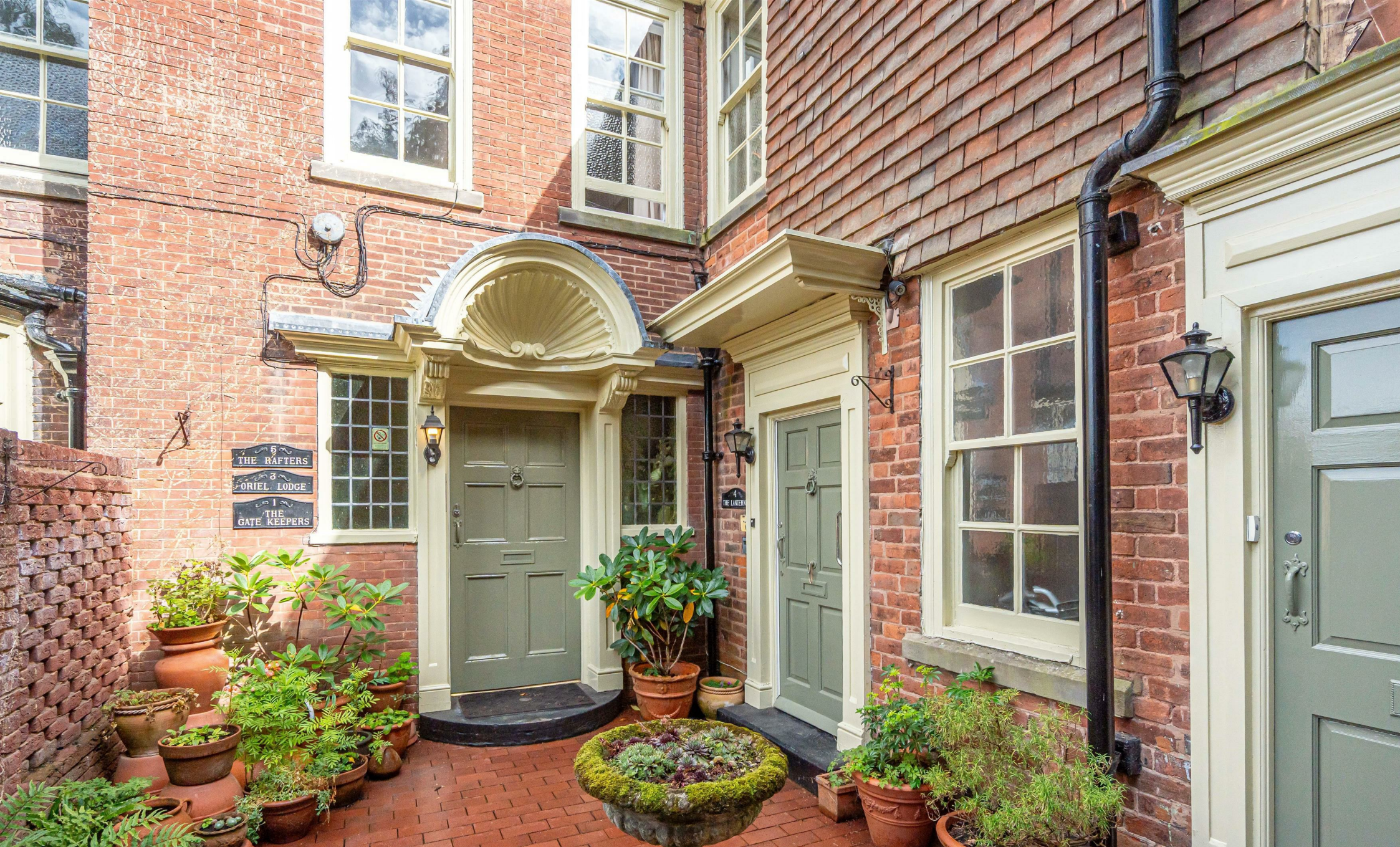
Flat 1, Dippons House Dippons Drive, Wolverhampton, WV6 8HJ